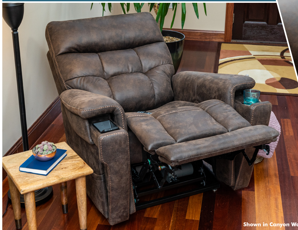
Shown in Canyon Walnut Fabric