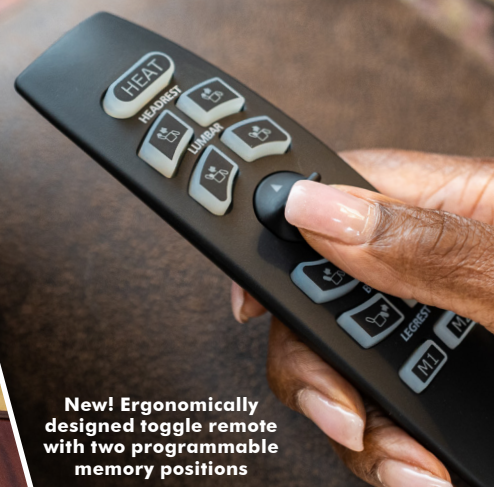
New! Ergonomically designed toggle remote with two programmable memory positions