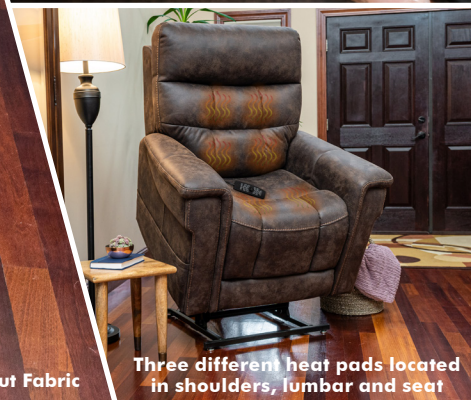
Three different heat pads located in shoulders, lumbar and seat