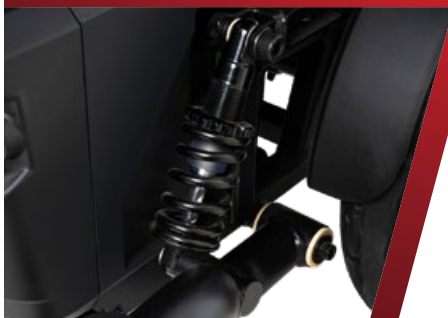
Front and rear independent Active-Trac® ATX Suspension