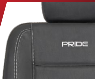
High-back memory foam seat