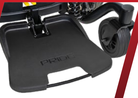
Large footplate with removable rubber cover for easy cleaning