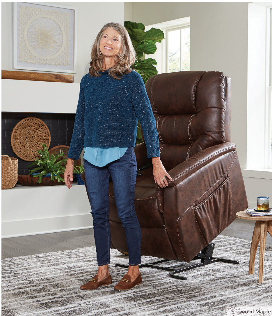
Shown in Maple