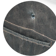
Convenient built-in USB charging port for your phone or tablet located on the outside arm.

SmartTek Diagnostic System STANDARD on all Golden models. Designed and engineered in Old Forge, PA. Assembled in China using Golden components.