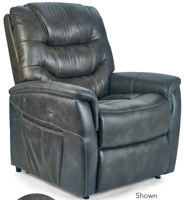
Shown in Graphite