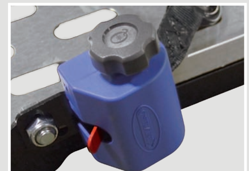
Q'Straint Retractable Hooks