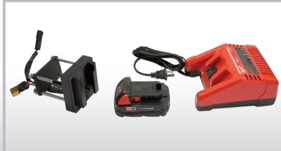
Battery Kit - ALBAT