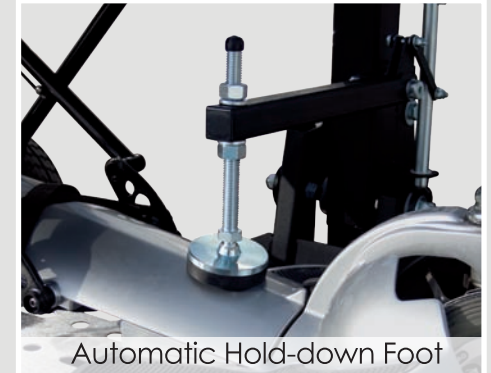
Automatic Hold-down Foot