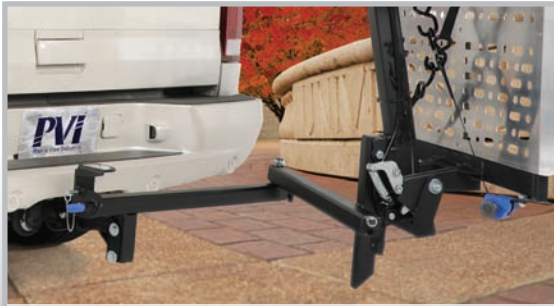
Swing-Away - AL105