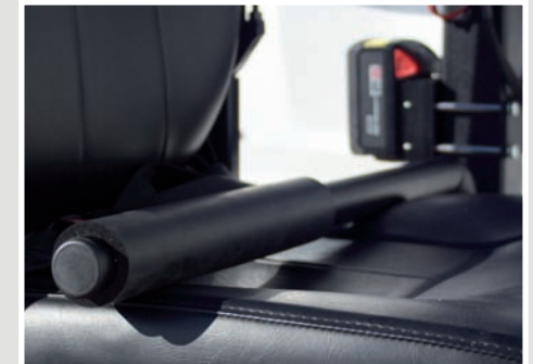
Automatic Hold-down Arm