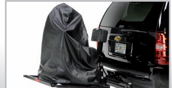
Wheelchair and Scooter Covers