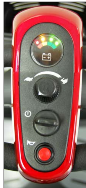
Figure 13. Key Switch (On)