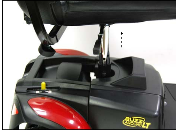
Figure 8: Seat Rotation Adjustment