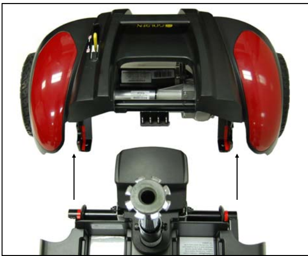
Figure 19. Drivetrain Alignment

3. Gently lower the battery pack onto the frame. See figure 21.