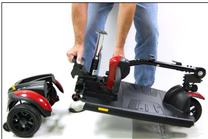
Figure 17. Separating the Drivetrain and Frame

8. Pull the front frame up and off of the drivetrain. See figure 17.