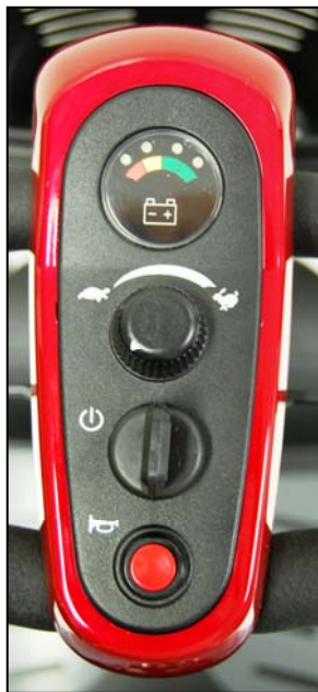
Figure 12. Key Switch (Off)