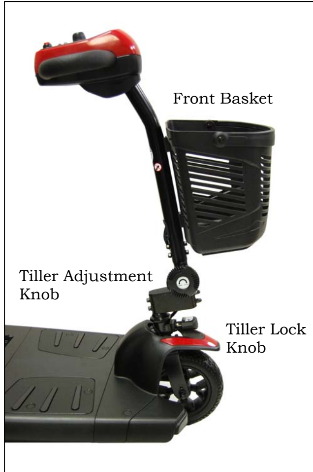
Figure 22. Tiller Raised