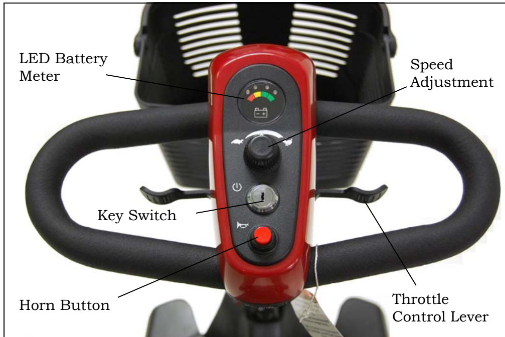
Figure 5. Buzzaround Lite™ Delta Tiller Control Panel