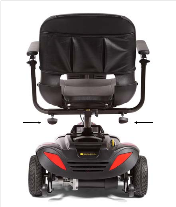
Figure 6. Armrest Width Adjustment