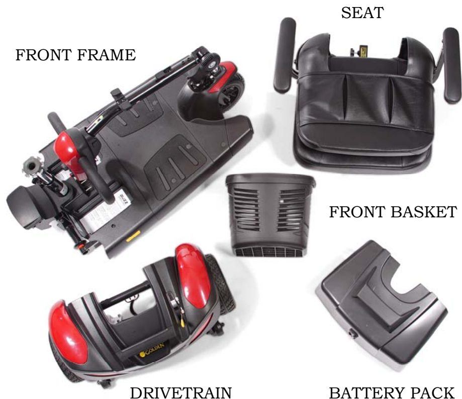
Figure 18. Buzzaround Lite™ Components (Model GB107)

Ensure that all components in the scooter have been correctly assembled. During assembly, please check that all connecting/locking devices are holding in place.