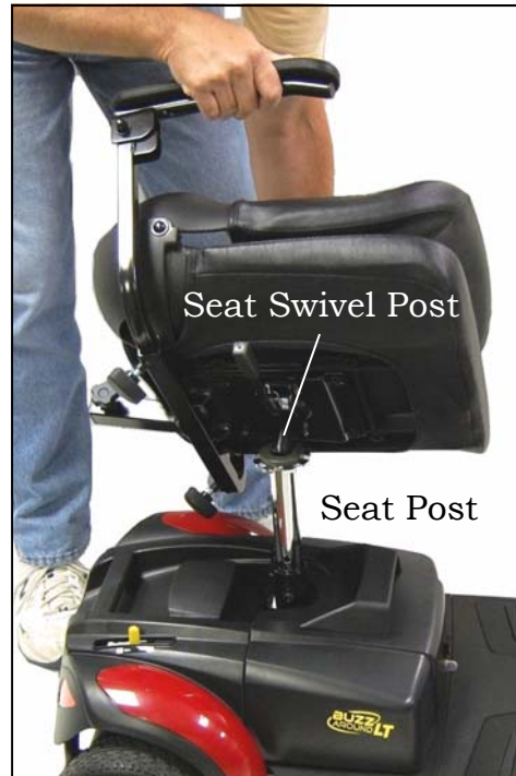
Figure 23. Installing the Seat