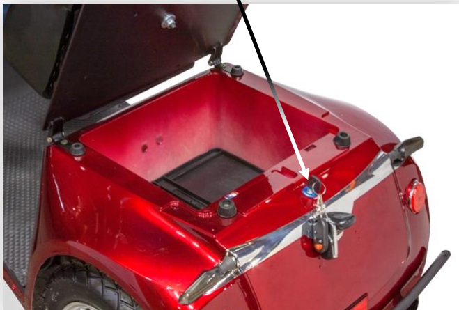
Insert Key into Trunk Lock