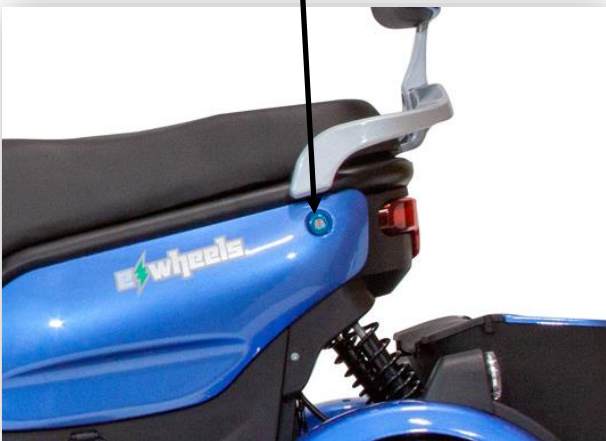
Insert Key into Rear Lock