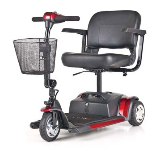
Figure 25. Buzzaround XL

NOTE: All Golden Buzzaround XL scooters can be equipped with docking devices for loading onto a vehicle by means of a mechanical lift or hoist. Contact your Golden Technologies, Inc. dealer for more information concerning docking devices and scooter lift devices.