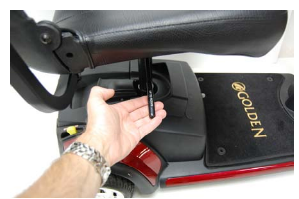
Figure 8: Seat Rotation Adjustment