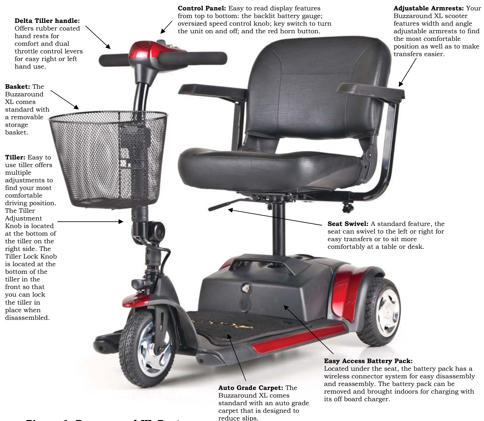
Figure 1. Buzzaround XL Features

Your Buzzaround XL™ scooter has been designed with your comfort in mind. It has also been designed to be a safe method of transportation when safety and operating instructions are followed. Please review the features and benefits of certain components of the Buzzaround XL scooter below.