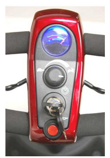
Figure 14. Key Switch (On)