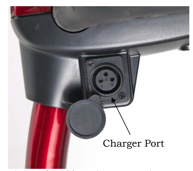
Figure 27. Charging Batteries