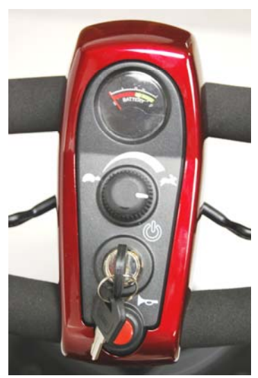
Figure 13. Key Switch (Off)