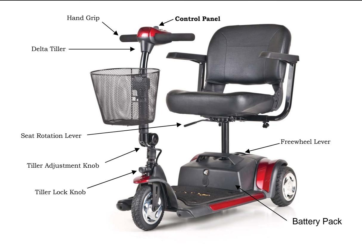
Figure 4. Your Golden Buzzaround XL