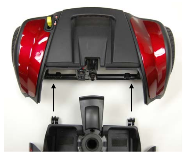
Figure 20. Drivetrain Alignment

3. Gently lower the battery pack onto the frame. See figure 22.