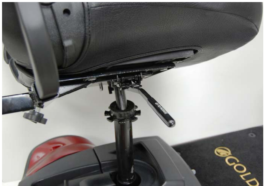
Figure 24. Installing the Seat

WARNING Pinch Point! Keep hands and clothing clear of the seat swivel post and seat post.