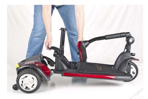
Figure 18. Separating the Drivetrain and Frame