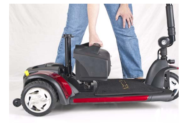
Figure 22. Battery Pack Installation