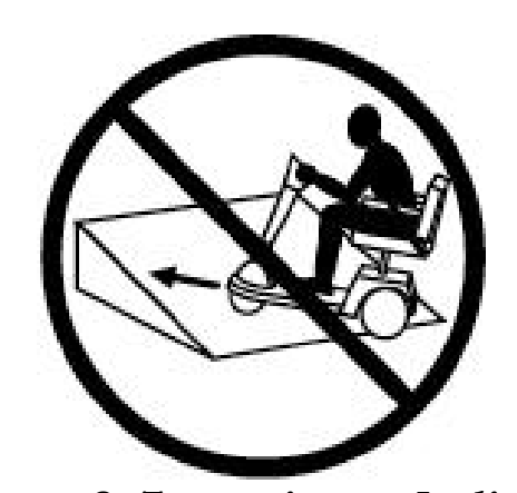
Figure 3. Traversing an Incline

WARNING If, while you are driving down a slope, your scooter starts to move faster than you feel is safe, release the throttle control lever and allow your Buzzaround XL to come to a stop. When you feel that you again have control of your scooter, push the throttle control lever forward and continue safely down the remainder of the slope.