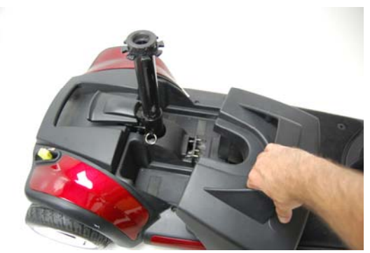
Figure 16. Removing the Battery Pack

4. Lift the battery pack off the scooter. See figure 16.