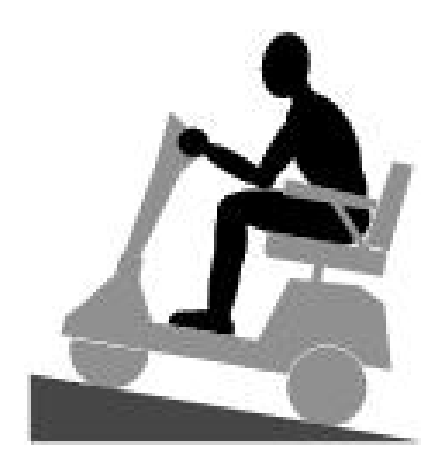
Figure 2. Going Up an Incline