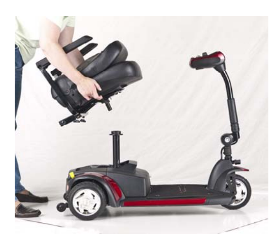
Figure 15. Removing the Seat