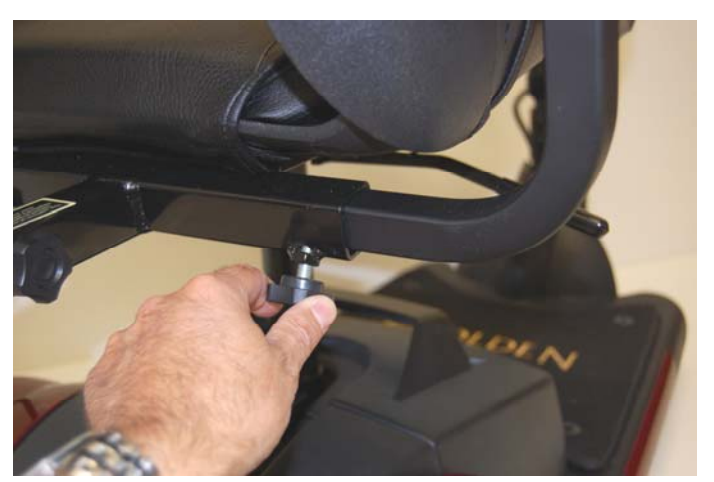
Figure 6. Armrest Width Adjustment