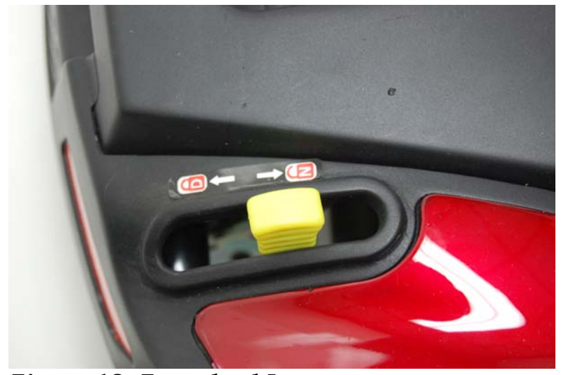
Figure 12: Freewheel Lever

Your Buzzaround XL<sup>TM</sup> is equipped with a freewheel lever that can set your scooter in or out of freewheel mode.