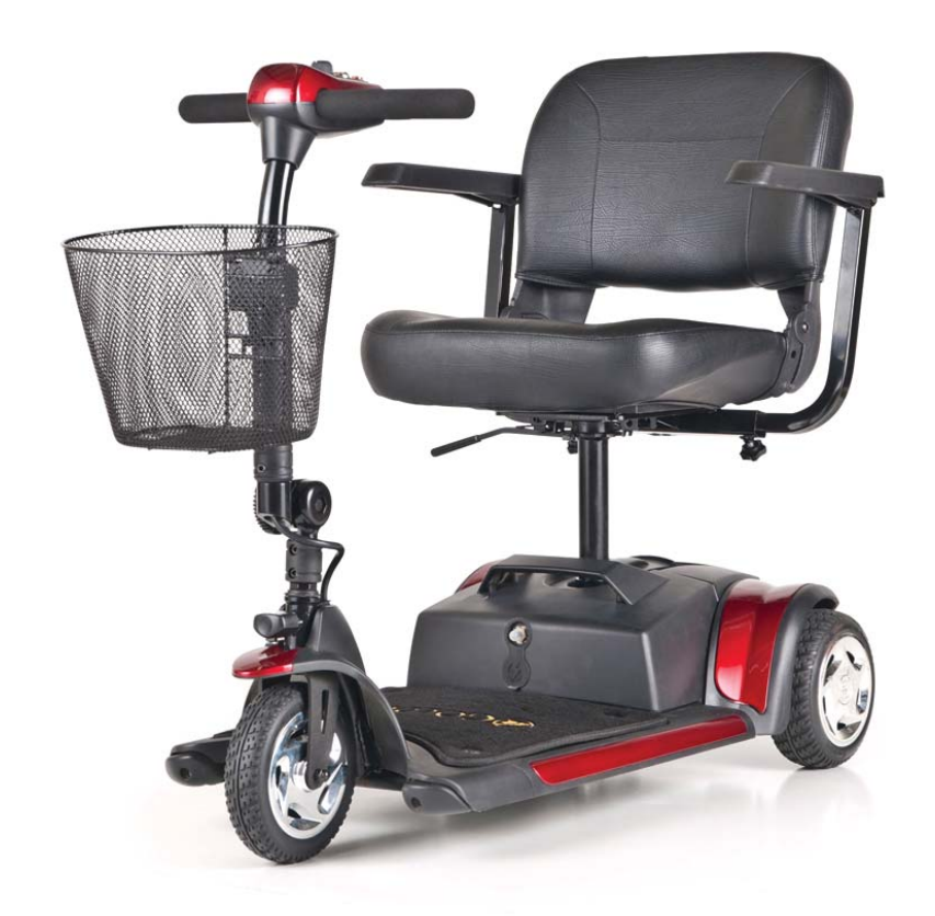
Owner's Manual MODEL GB116