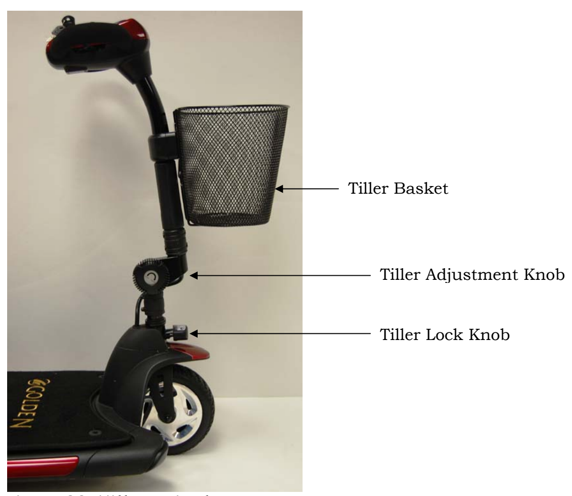
Figure 23. Tiller Raised

WARNING MAKE SURE YOU TIGHTEN YOUR TILLER KNOB TO BE SURE IT IS SECURED IN THE DESIRED POSITION!