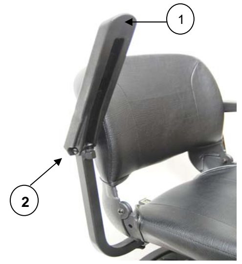
Figure 7. Flip-up/Angle Adjustment