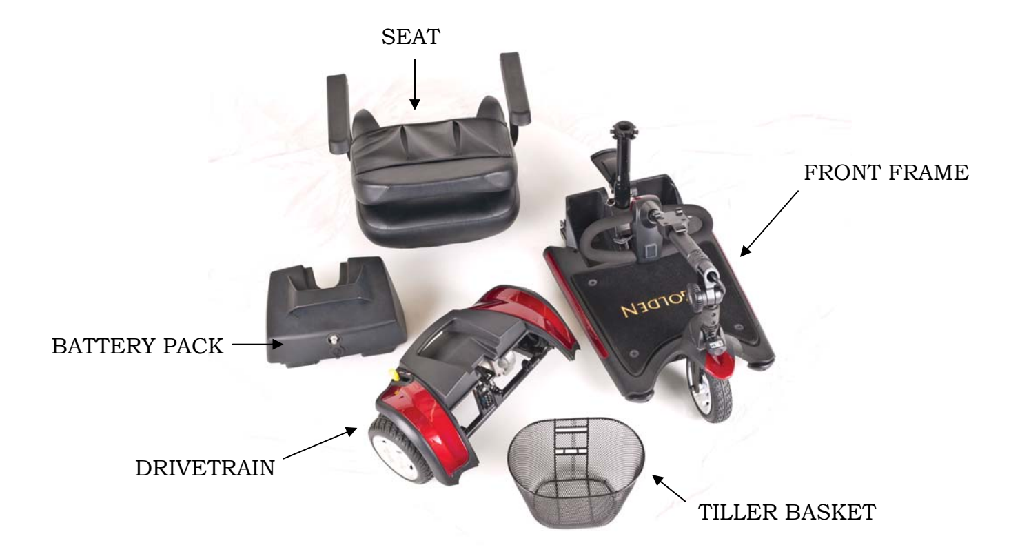
Figure 19. Buzzaround XL Components

Ensure that all components in the scooter have been correctly assembled. During assembly, please check that all connecting/locking devices are holding in place.