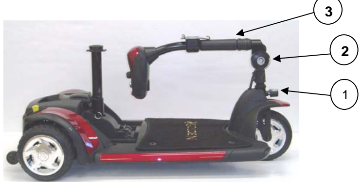
Figure 17. Lowered Tiller

6. Push in and turn the tiller lock clockwise 90 degrees. See #1 on figure 17. This will lock the front wheel to keep it from turning side to side to help control while carrying.